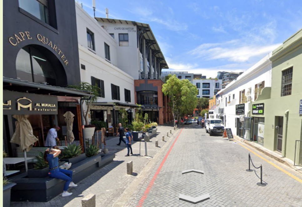
Jarvis Street, Waterkant

Respond to the character, contextual language and identity of an area.