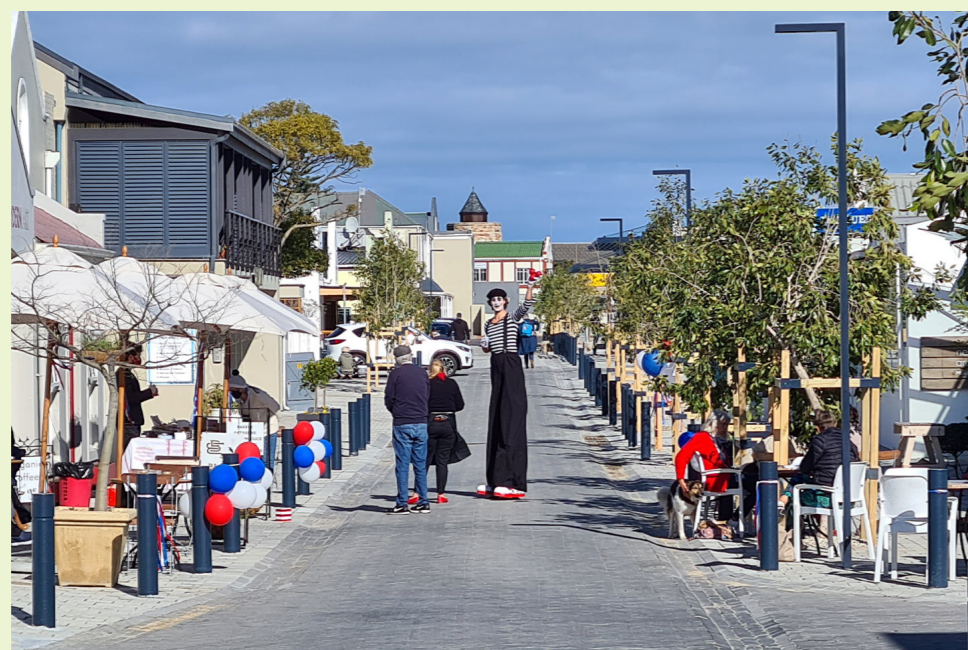
Hermanus High Street

The 'whole' above the 'parts'. Integration, permeability and enhancement.