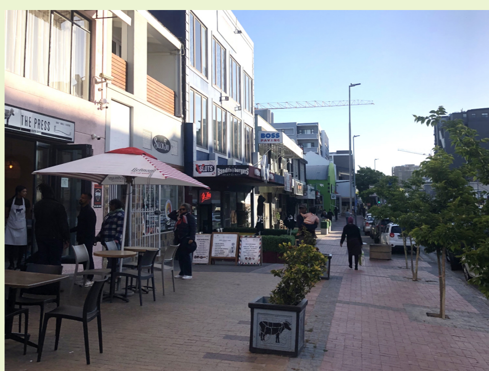
Sea Point Main Road

Design human-scaled streets as positive public space and ensure positive interfaces onto the public realm.